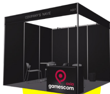
Standard Shell Scheme