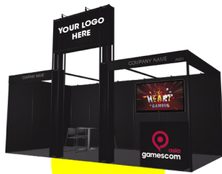
Premium Shell Scheme