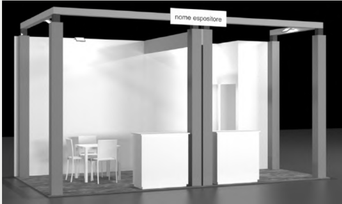
Example 18 sqm. turnkey area

A simple and functional layout , ideal for business and networking. Cibus Tec Forum participation will be smart and easy thanks to a two-day time effective formula.