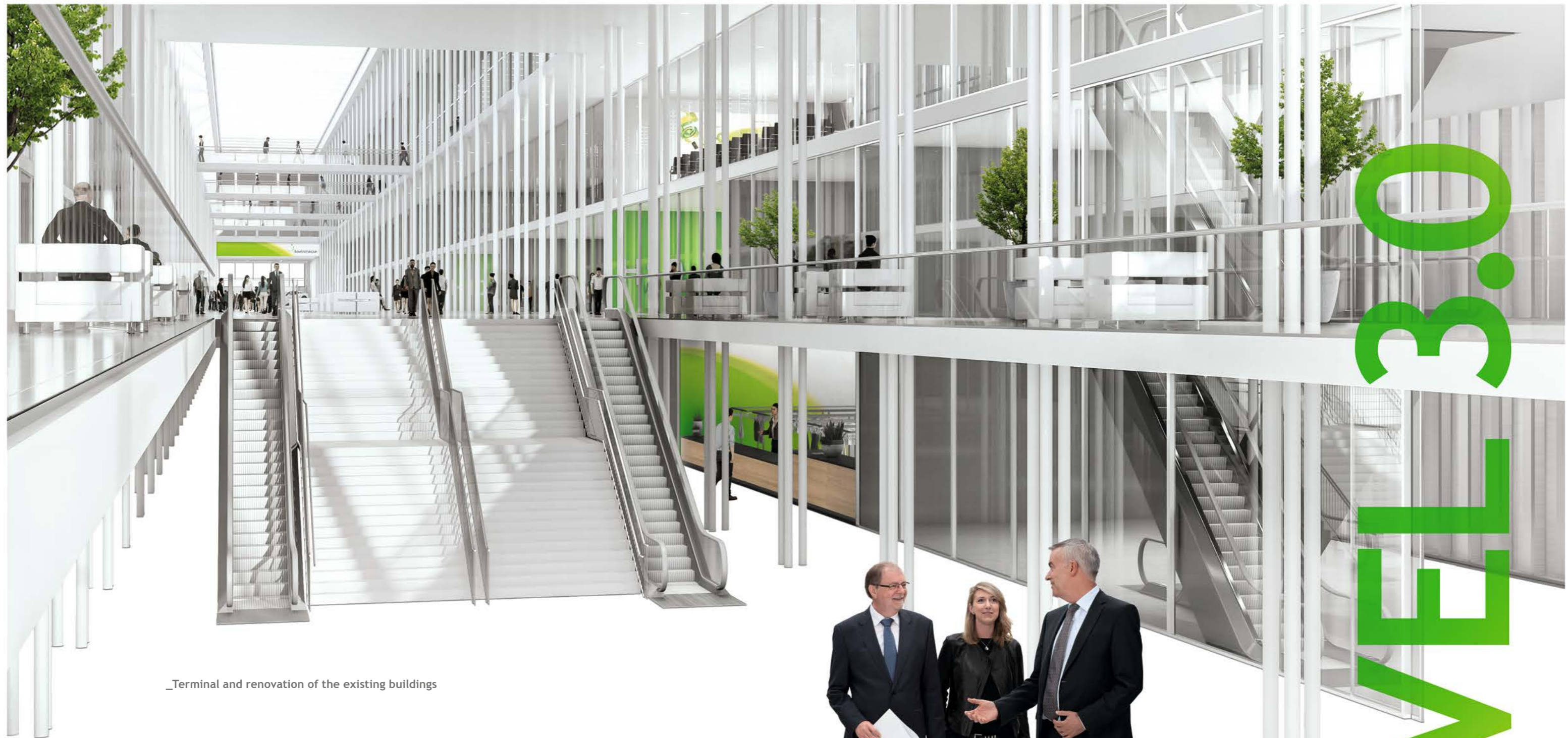
_Terminal and renovation of the existing buildings